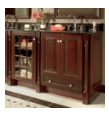
□ Traditional. Timeless. Warm and comfortable elegance.